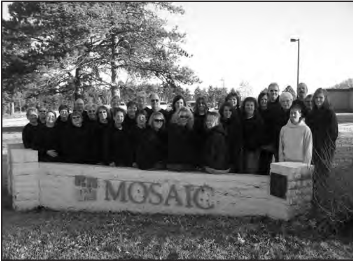
Various groups of Mosaic staff who were available for a photo opportunity that morning

On the day before Thanksgiving, employees from Mosaic in Beatrice expressed one of the things they are especially thankful for during the holidays — Mosaic! Several weeks earlier, all Beatrice Mosaic employees had received a blue Mosaic sweatshirt. To show their support for Mosaic, it was decided this was the perfect day to wear their shirt as a sign of their thankfulness.